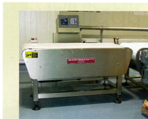
Ward Materials Handling Solutions LC-Checkweigher is used in a range of industries, such as food, dairy, poultry, confectionery, beverage, brewery, cement, pet food, logistics, plastics, paper, pharmaceutical, distribution centres and electronic.

"In 1999 I designed, developed and marketed the Low Cost Australian manufactured in-motion Checkweigher. My objective was to develop a robust, reliable, simple to use, quality built and affordable checkweigher for verifying the weight and integrity of products